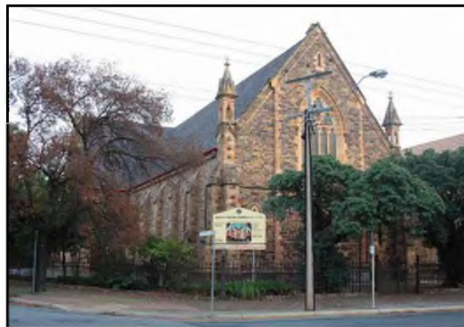
Wesley Uniting Church (Kent Town) located at 27 Fullarton Rd, Kent Town.

The visit and tour will commence at 1.30pm and conclude at 3.00pm. Cost of the event is $5 payable on the day and bookings are necessary as there is a limit on numbers participating (so please book soon)