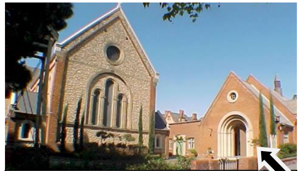
Venue : the Parish Hall, Christ Church, Jeffcott St, North Adelaide.