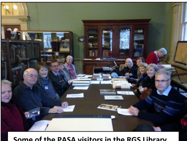
Some of the PASA visitors in the RGS Library

The 27 PASA members who recently visited the Library of the Royal Geographic Society all enjoyed the opportunity of viewing a range of original documents, maps and books of Matthew Flinders' coastal explorations around Australia. They were also impressed by the magnificent collection of geographic and historic materials housed in this library. Our thanks to the Society for making this visit possible.